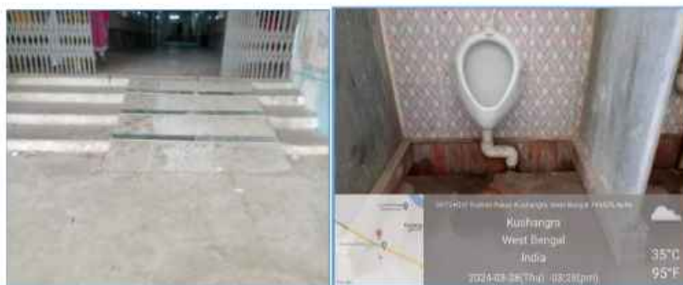
Ramps and low toilets for Divyangyan students

Beyond the academic activities, college also provides the awareness of female hygiene and menstruation. A sanitary napkin vending machine has been installed in college and the fund was granted by MP Nusrat Jahan.