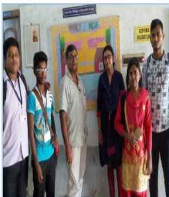
Wall magazine by Sociology