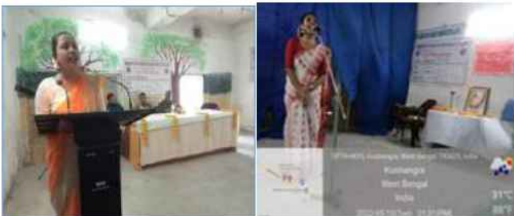
8. Vocal solo by students