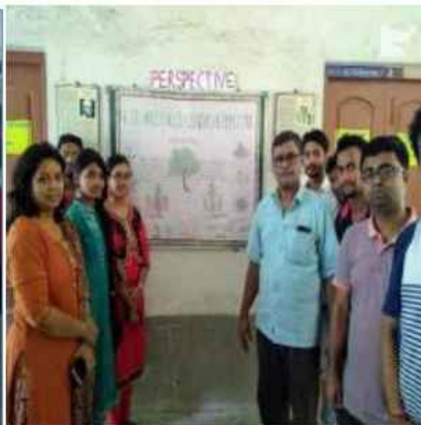
Wall magazine by English