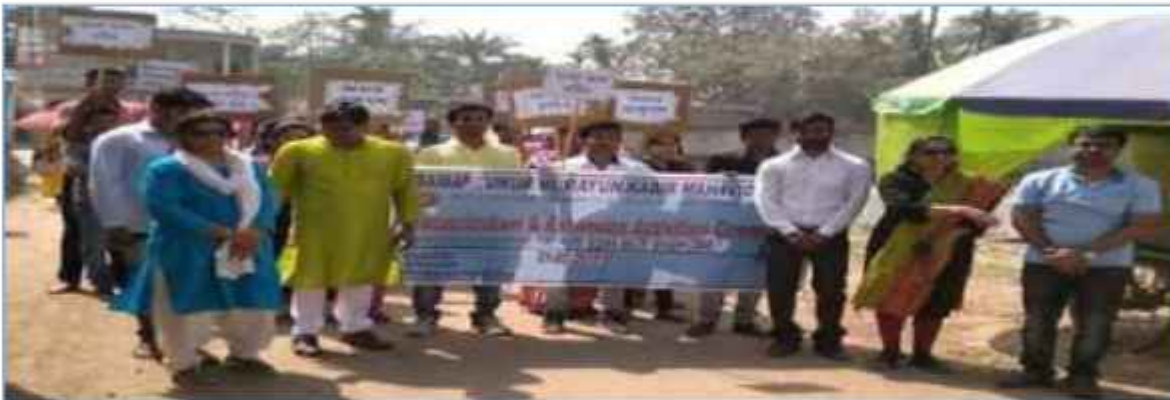
17. Rally of different departments