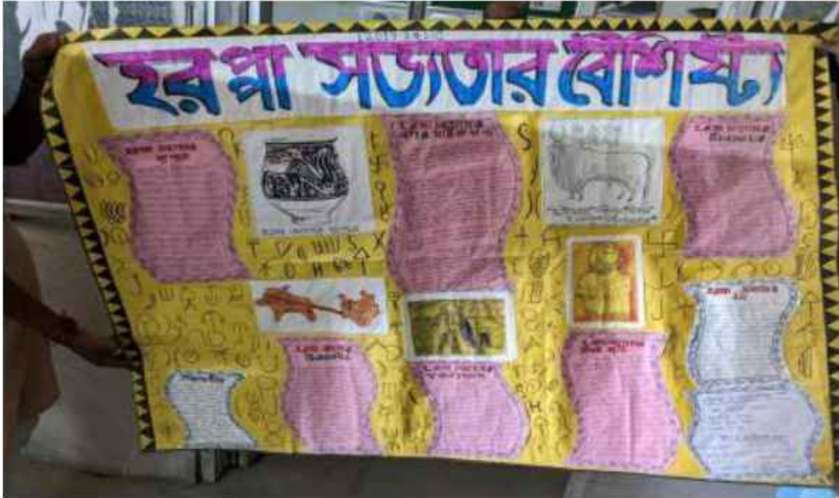
Wall magazine by History

Ph- 03217-260816 /(M) 9830362656 email : bhkm2007@gmail.com