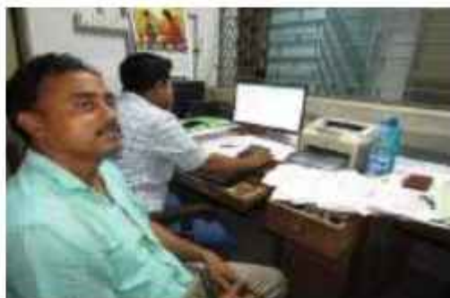
Computer's clerks' room and accounts office