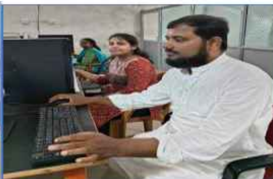
Computers in ICT classroom and academic room