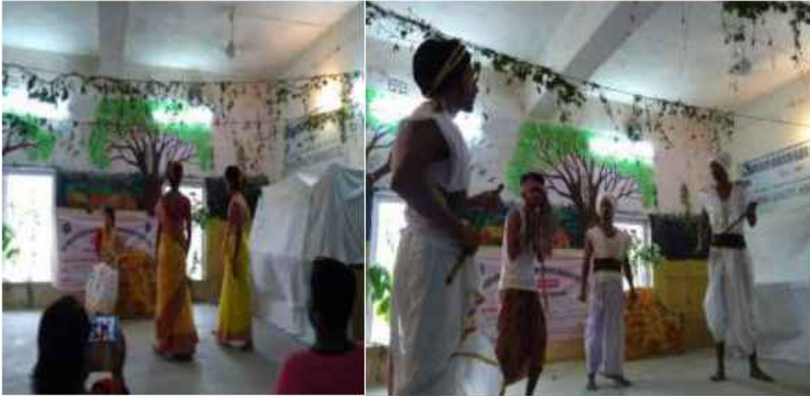
7. One act play by students and faculties respectively

Ph- 03217-260816 /(M) 9830362656 email : bhkm2007@gmail.com