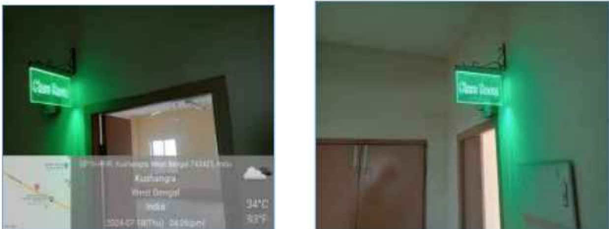
Classroom 3 and 4 annex