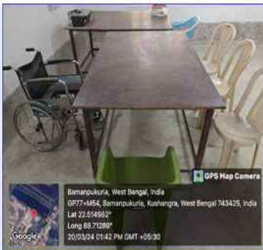
Sanitary napkin vending machine and reading section in library for Divyangyan students