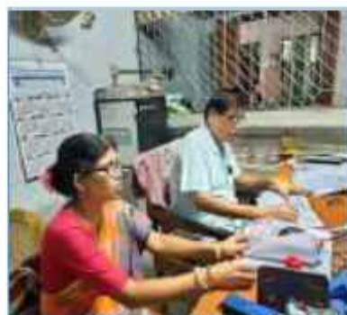
Computers in Principal's cabin, cashier's room and guard's room