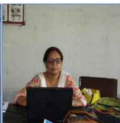
Computers and laptops usage by teaching staff