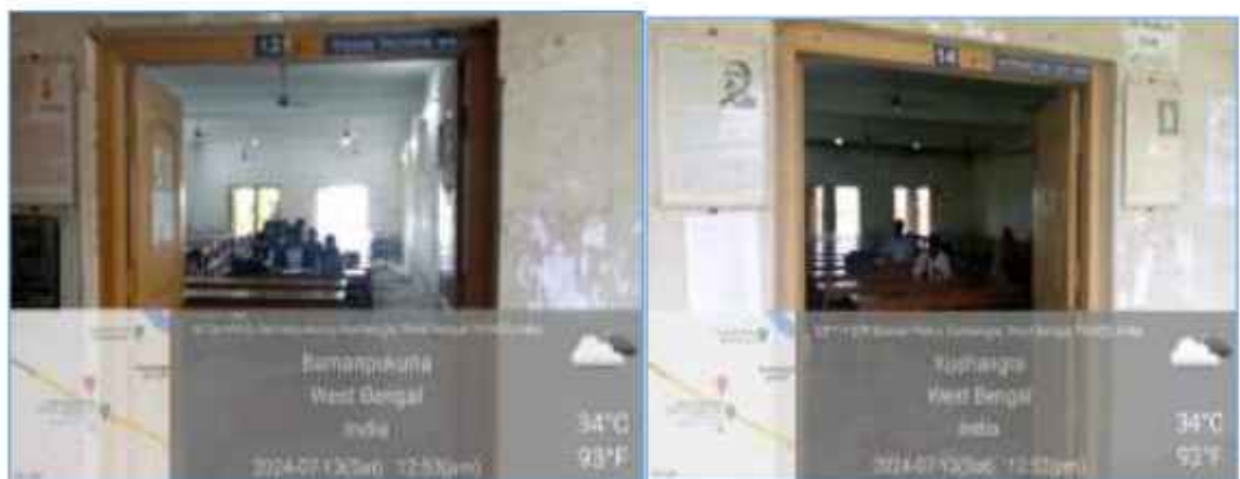
Room no.12 and 14