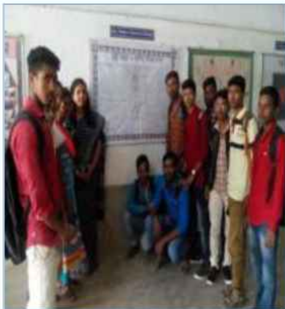
Wall magazine by Philosophy

Ph- 03217-260816 /(M) 9830362656 email : bhkm2007@gmail.com