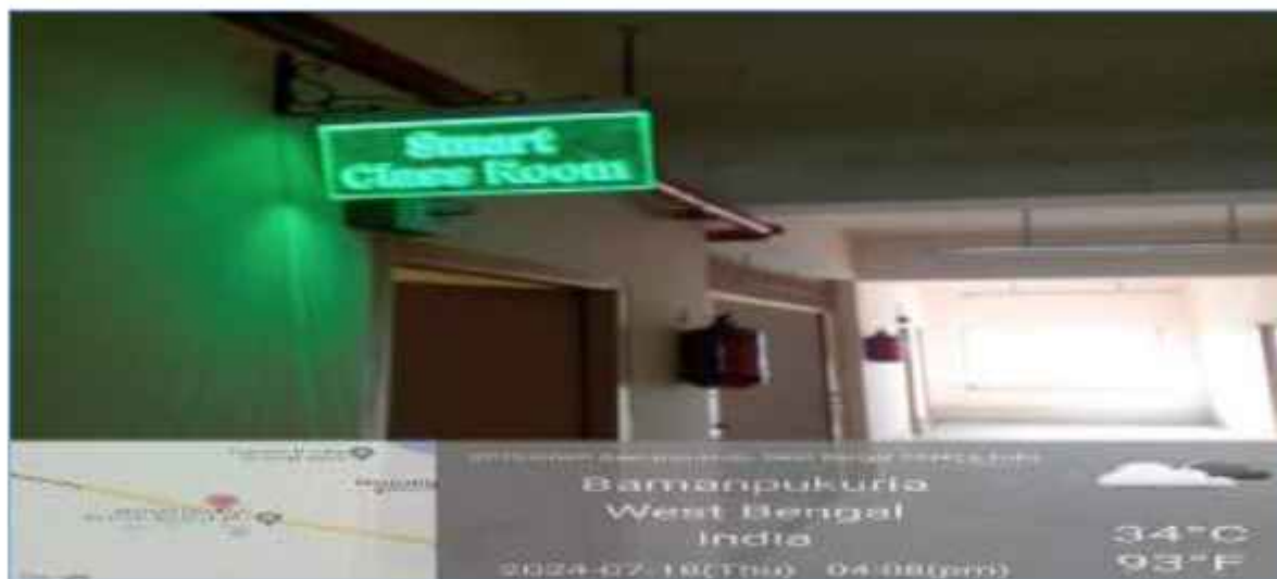
Smart classroom of annex building

Ph- 03217-260816 /(M) 9830362656 email : bhkm2007@gmail.com