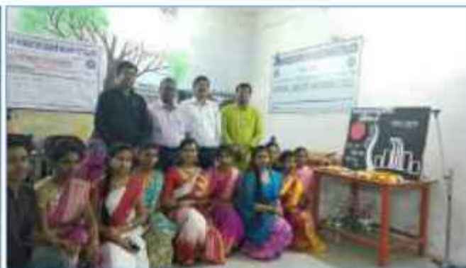
18. Celebration of International Mother Language Day