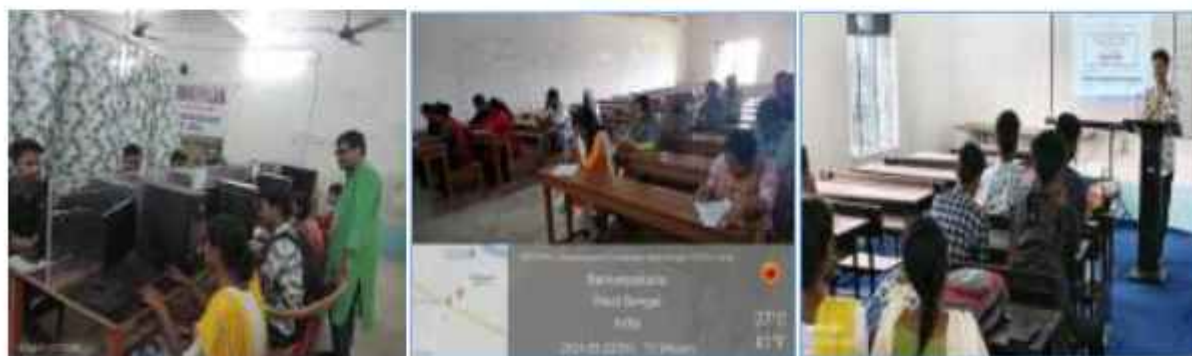
Students are in IT classrooms and giving examination in traditional classroom