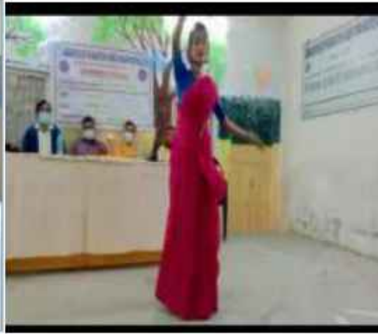
14. Classical solo dance performance