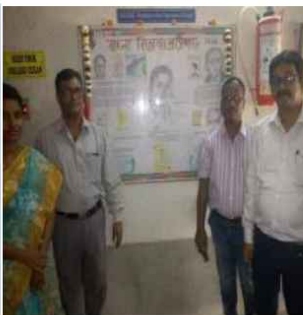
Wall magazine by Bengali