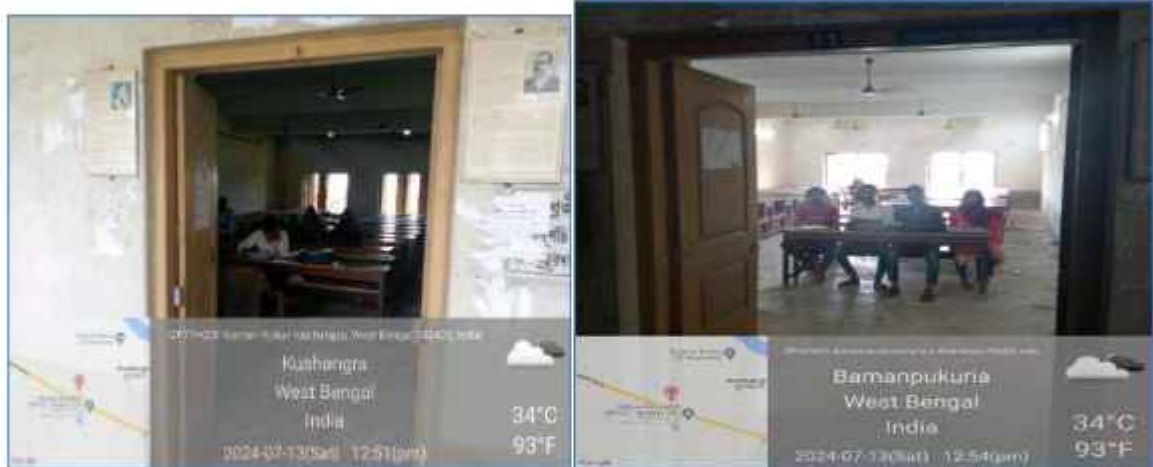
Room no.10 and 11