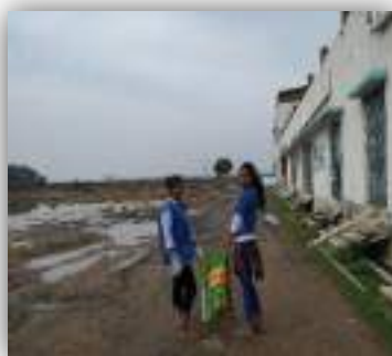
Volunteers working at the Front Garden