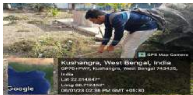
Sramdan By NSS Volunteers