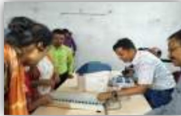
The hon'ble B.D.O. of Minakhan teaching the function of EVM and VVPAT to the volunteers