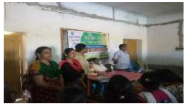
Dengue Awareness Programme