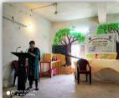
Volunteers talking about the camp: Figure-2