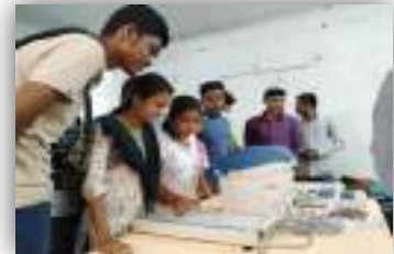
The volunteers learning the function of EVM and VVPAT

Handcraft Making Session: The volunteers then involved themselves in making various tools from daily used materials after a few minutes of break. They made pen keeper, waste bins, showpieces etc. to make an exhibition on the final day. Everyone was bit tired with the day's work but every moment gave them joy and a feeling of togetherness. The session came to an end at about 4.30 pm. The vote of thanks from the day in-charge followed accompanied by NSS clap.