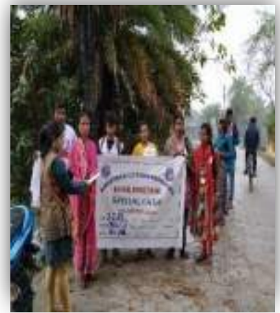
Volunteers going to the CristianPara to carry out the extension activity on the awareness on Dehydration

Extension Activity to Christian Para: After the end of the workshop a few volunteers were selected to conduct an extension activity to Christian Para which was the adopted village of the NSS of Bamanpukur Humayun Kabir Mahavidyalaya (at about 4 pm).. The villagers were delighted to receive the volunteers and others among themselves.