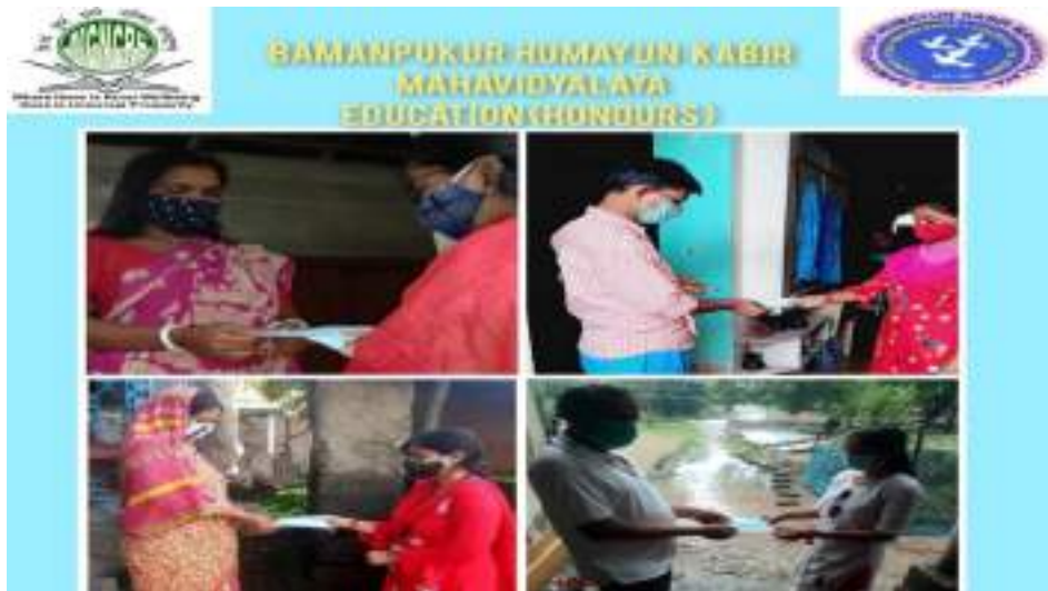
Awareness of Mask and sanitizers