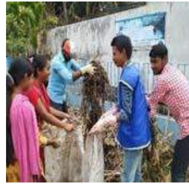
Volunteers transferring garbage to the waste management area