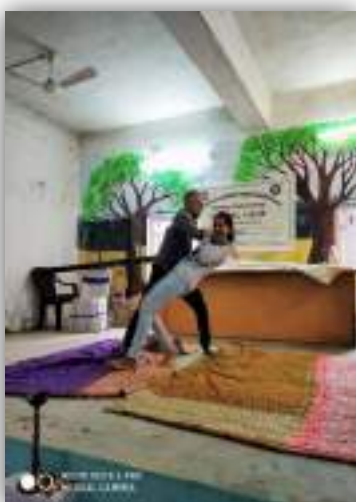
The Resource Person demonstrating techniques of Self-defence: Figure-13