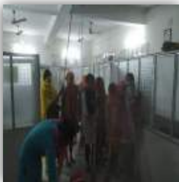
Volunteers cleaning the cubicle area

Shramdan: The volunteers cleared the garden area allotted for the day and completed their task by 1.30 pm. They cleaned themselves and went for their lunch. After lunch they all gather in the seminar hall to attend the workshop at about 02.00 pm.