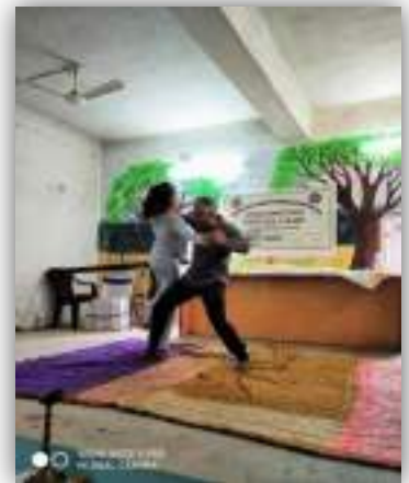
The Resource Person demonstrating techniques of Self-defence: Figure-12