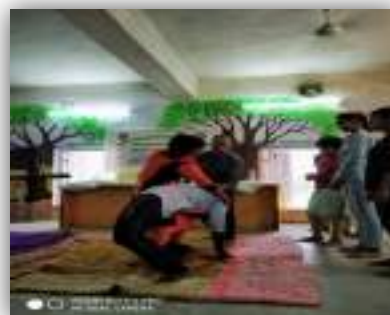
The Resource Person demonstrating techniques of Self-defence: Figure-5