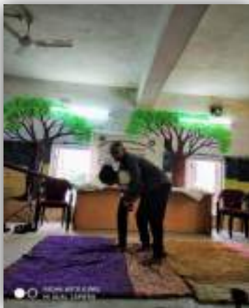
The Resource Person demonstrating techniques of Self-defence: Figure-10