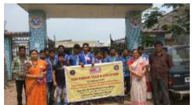
N.S.S & Red Ribbon Club -rally cum awareness programme for Thalassemia