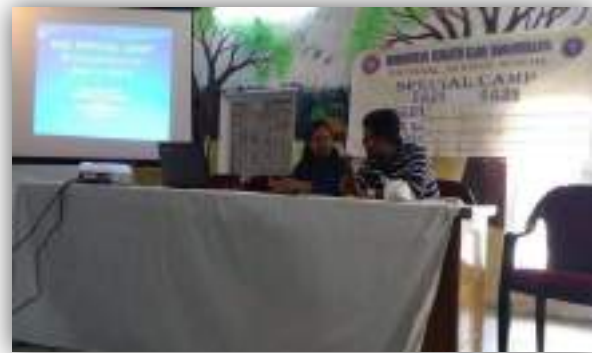
The Day in-charge and Programme Officer interacting with each-other