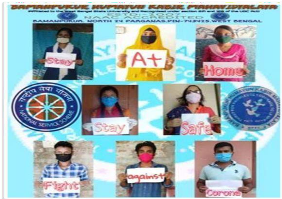
Usage of Mask Awareness Posters By the Volunteers