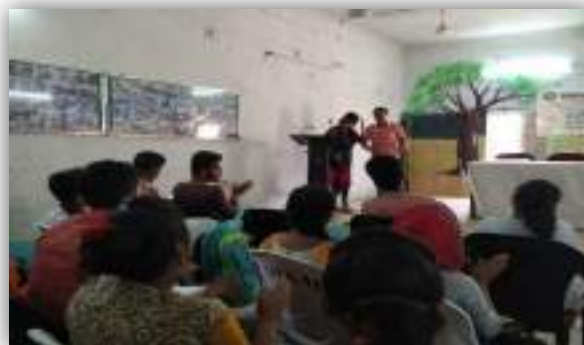
Day in-charge interacting with the Volunteers: Figure- 2