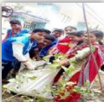
Volunteers working at the herbal garden: Figure-5