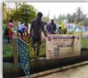
Volunteers gathering wastes in the waste bin