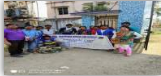
Volunteers with the Day In-charge and Programme Officer and other Faculty members: Figure-2