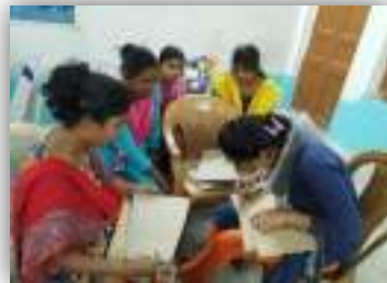
Volunteers making handcrafts: Figure-2