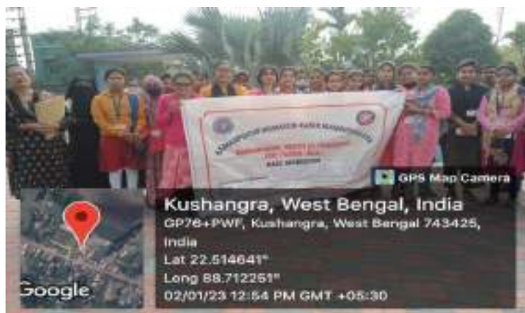
Volunteers in the cleanliness drive