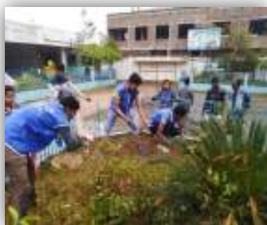
Volunteers with the Day in-charge and the Programme Officer

Shramdan: The theme of the third day of the NSS special camp was „Digital India“. The day in-charge was Sumita Chatterjee. She gave a brief introduction to the day's theme, followed by the announcement of the day's work schedule by the programme officer. The volunteers then were led to the site for the Shramdam at about 11.30 am. The selected site was the right half of the garden area just in front of the college building. Three groups were formed and accordingly the worksite was distributed among them. The portion selected for the shramdan of the day was cleaned by the volunteers. The volunteers after that cleansed themselves for lunch. After the lunch session all volunteers and the day in-charge Sumita Chatterjee.