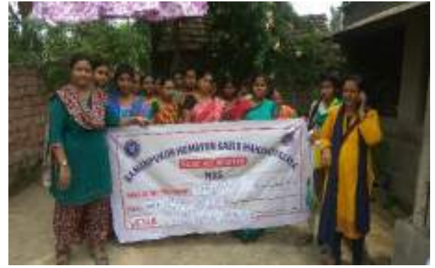
Swachhata Pakhwada and awareness Programme at adopted village Christian Para .