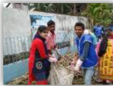
Volunteers gathering garbage from the front of the water management area