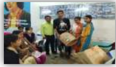
The Day In-charge supervising the session