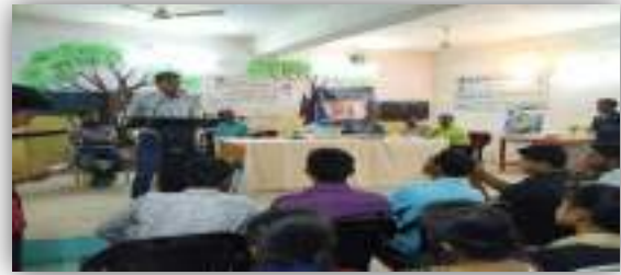
The hon'ble B.D.O of Minakhan introducing the EVM and VVPAT to the volunteers