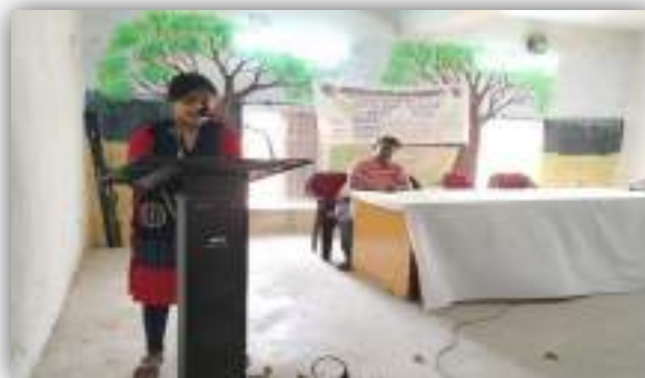
Volunteers interacting with one another: Figure- 2