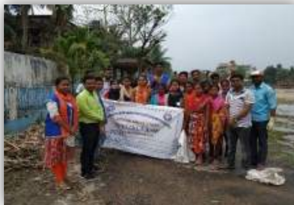
Volunteers in the ground

The workshop began at 02.00 pm. The day in-charge made a brief introduction to the Process of General Election and the use of electronic voting machine. The honourable B.D.O. of the Minakhan Block especially came as the guest of honour and resource person to teach the volunteers the function and use of the EVM and VVPAT machine. He and one of the officials gave a formal introduction to the concept of the 17 th Lok Sabha Election, 2019 and the important role of the voters to make the election a successful event. The honourable B.D.O. then went on to theoretically explain the technicalities of the electronic voting machine and the function of the newly introduced Voter Verifiable Paper Audit Trail or VVPAT in the election. The process and functions of EVM and VVPAT were taught by hand by the B.D.O. and his Officials. The volunteers who were mostly composite of new voters took delight in learning the process. And the workshop was a great success. After the completion of the workshop the day in-charge thanked the honourable B.D.O. and his officials for conducting the workshop with their own tools and technicians in the NSS special camp. The workshop concluded at 3.30 pm.