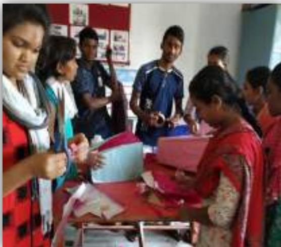
Volunteers giving the final touches to the handcrafts

Exhibition of Handcrafts: The Volunteers' own hand-made crafts that they completed during the camp were put for exhibition at the dais.