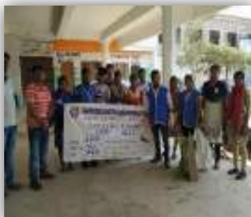
Group-2 with the Day in-charge