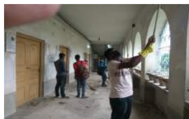
Cleanliness Drive at B.H.K.M by N.S.S volunteers.