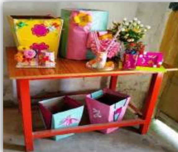
The handcraft made by the volunteers