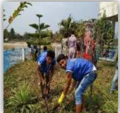
The volunteers working at the front garden