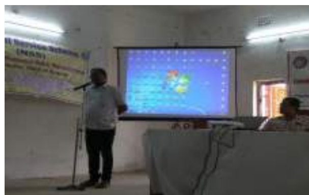
Shantiniketan Utsav- Tree plantation.