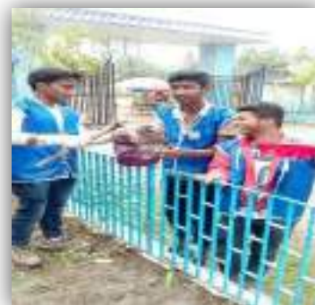
Volunteers working at the herbal garden: Figure-6