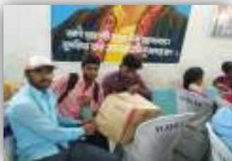
Volunteers making handcrafts: Figure-4