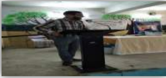
B.D.O. Official introducing the EVM and VVPAT to the volunteers