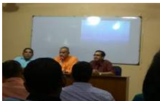
Orientation Programme of NSS at Ramakrishna Mission Narendrapur.