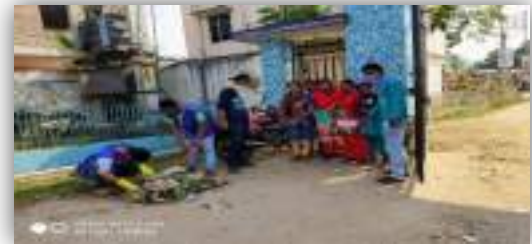
Shramdan by Volunteers: Figure-2

The Interactive Session: The interactive session began at about 02.00 pm at the seminar hall. Since it was the first day, all volunteers introduced themselves to one another and share their experience of the day's works. This continues for one hour. This is followed by an half an hour of tea break. After that the cultural session began.