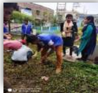
Volunteers in the Garden