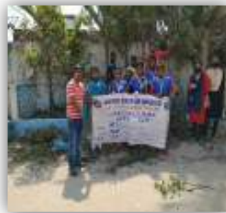
Group- 3 with the Day in-charge