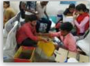
Volunteers making handcrafts: Figure-3