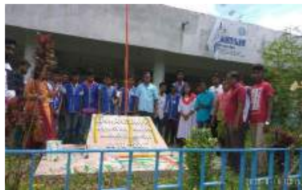
Celebration of Independence Day at B.H.K.M