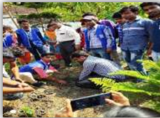
The Programme Officer participating in tree plantation programme on the valedictory