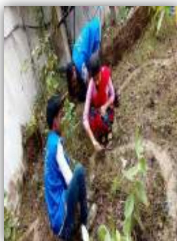
Volunteers working at the herbal garden: Figure-2