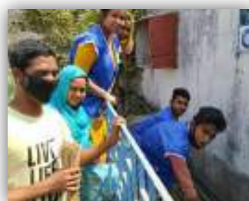
Shramdan of the Third Group at the water harvesting area