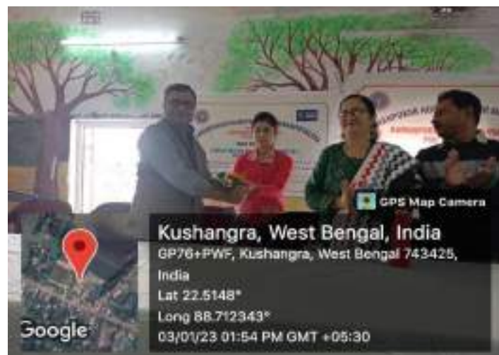
Seminar Hall Seminar on Students' Welfare