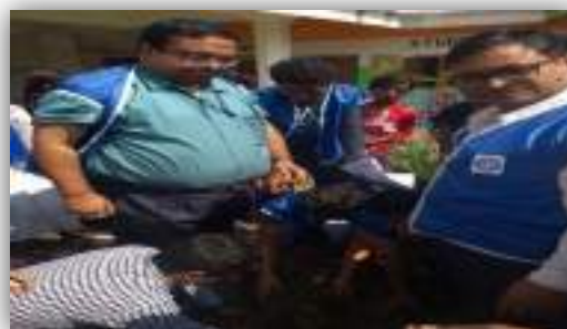
Honourable Principal wearing the NSS Uniform during tree plantation programme