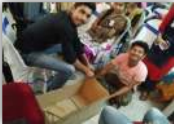
Volunteers making handcrafts: Figure-1

Handcraft Making Session: The volunteers then involved themselves in making various tools from daily used materials after a few minutes of break. They made pen keeper, waste bins, showpieces etc. to make an exhibition on the final day. Everyone was bit tired with the day's work but every moment gave them joy and a feeling of togetherness. The session came to an end at about 4.30 pm. The vote of thanks from the day in-charge followed accompanied by NSS clap.