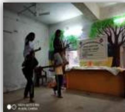
The Resource Person demonstrating techniques of Self-defence: Figure-2