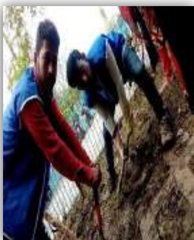
Volunteers working at the herbal garden: Figure-1

Shramdan: It was the last day of the 7 Day NSS Special Camp, i.e. the Valedictory Day. The Day in-charge was the Programme Officer, Ashis Biswas. The day began with the volunteers gathering in the seminar room (at about 11.00 am) from where they were led to the worksite of the day, i.e. the herbal garden. Here the volunteers worked from 11 am to 1 pm and completed the work allotted to them. Then they went for the lunch and after the lunch they gathered at the front garden area for tree plantation programme.