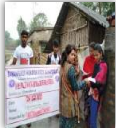
The Extension programme to Christian Para on the Awareness Dehydration in collaboration with The Health and Hygiene Cell