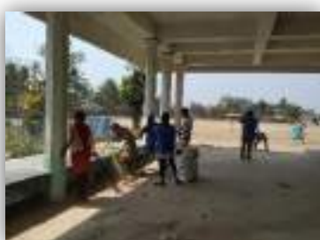
Shramdan of the Second Group in the front area of the college building