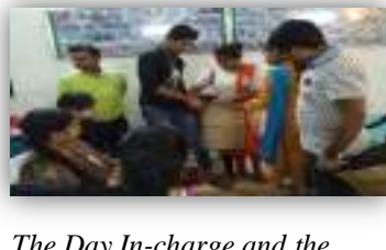
The Day In-charge and the Programme Officer supervising the session