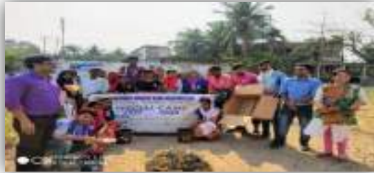
Volunteers with the Day In-charge and Programme Officer and other Faculty members: Figure-1

Shramdan: The volunteers were taken to the work site at about 12.00 pm for initiating the shramdan session. The outside vicinity and the drains attached to the gardens at the college premises were selected for that days cleaning work.. The entire work site was divided into three parts and was distributed to three groups of Volunteers. They finished cleaning the area by 01.30 pm. This is followed by the lunch session. The volunteers properly cleaned themselves and had their lunch. After this they meet at the seminar hall where the interactive session began.