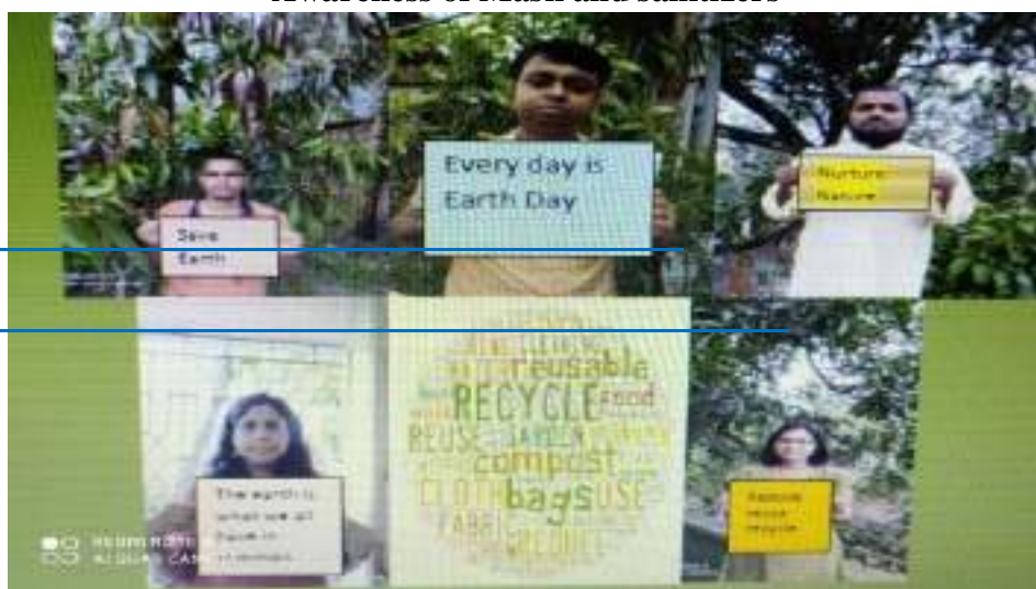
Poster release on Environment