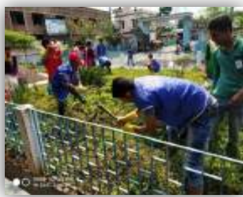
The volunteers working at the front garden: Figure-14