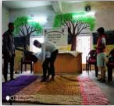
The Resource Person demonstrating techniques of Self-defence: Figure-8