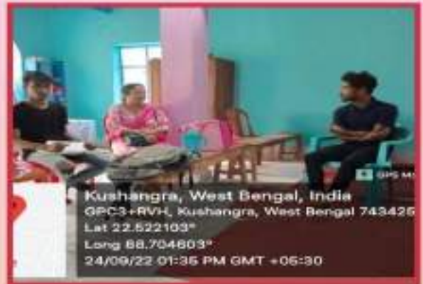
NSS Day at Christian para