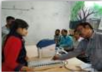
B.D.O. Officials teaching the function of EVM and VVPAT to the volunteers