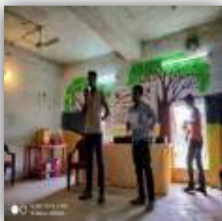
Volunteers talking about the camp: Figure-1

Volunteers Speech on the themes of NSS Special Camp: A few among the volunteers were selected to throw their observation on their experience of the camp and air view on the themes of each day of the camp. Volunteers showed confidence while putting their observation and all agreed that the camp was great experience for them; they learnt many things: the effectiveness of group work and helping one another, sharing with each other are a few of them.