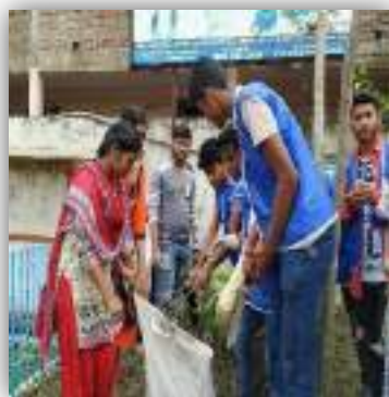
Volunteers cleaning the garden right side of the college gate