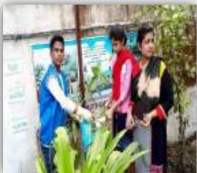
Volunteers working at the herbal garden: Figure-4