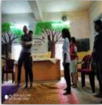
The Resource Person demonstrating techniques of Self-defence: Figure-7