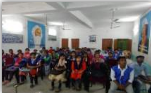
Volunteers attending the seminar session