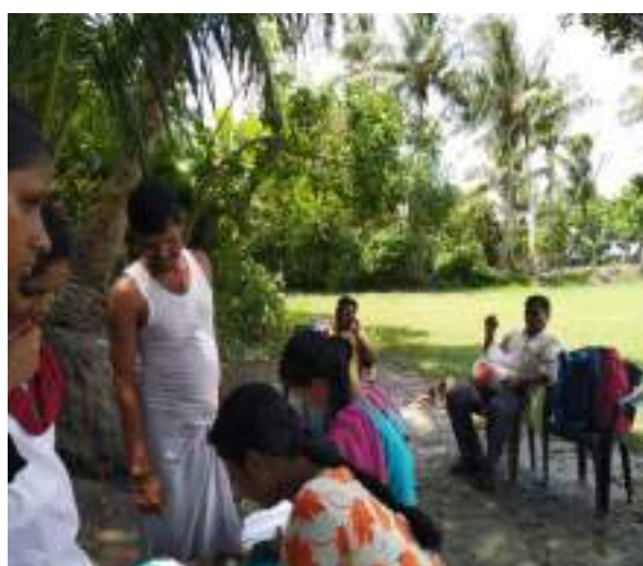
Meet with the villagers at Christian para