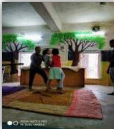
The Resource Person demonstrating techniques of Self-defence: Figure-11