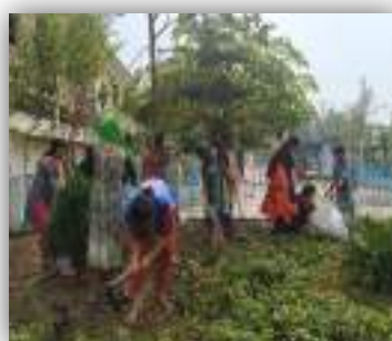
Volunteers taking the wastes to the waste management area