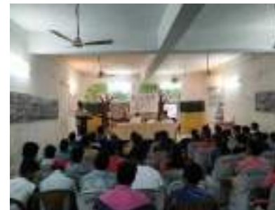
The Day In-charge addressing the volunteers