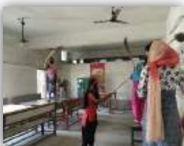
Shramdan of the First Group at the College building