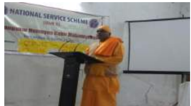
Seminar on Quami Ekta