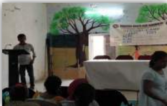
Volunteers interacting with one another: Figure- 1