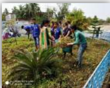
The volunteers working at the front garden: Figure-13