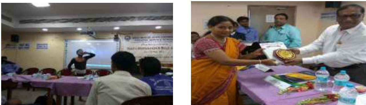
Youth Motivation and Role of NSS