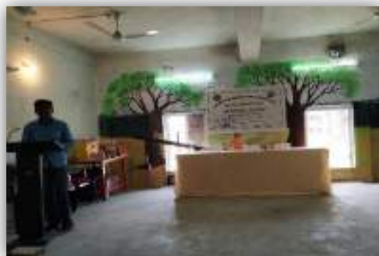
Song by S.N.Verma