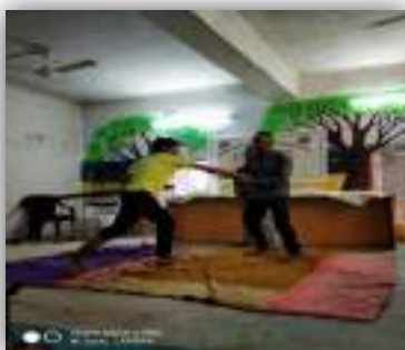
The Resource Person demonstrating techniques of Self-defence: Figure-4