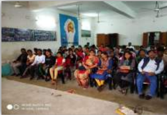
The NSS volunteers, the guests and the college faculty members attending the seminar