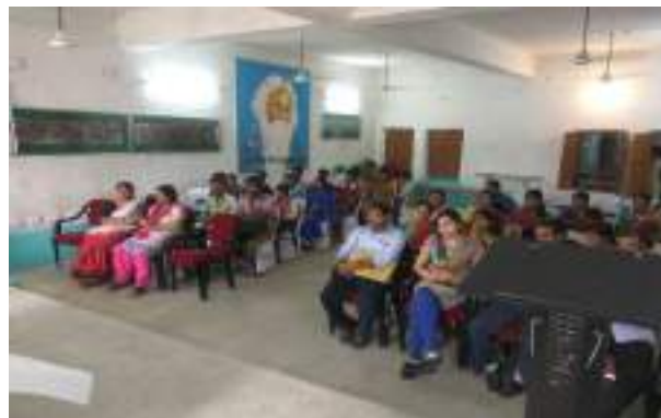
National Unity Day