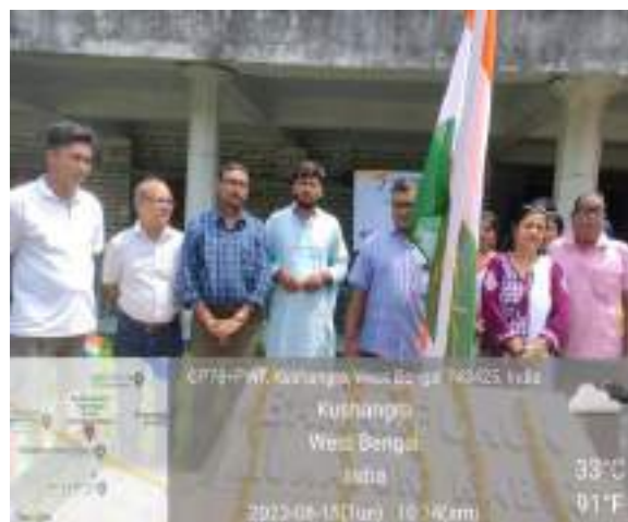
NSS Observed Independence Day