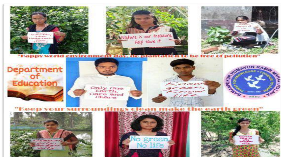
Covid Awareness Posters by the volunteers