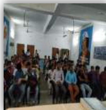
Volunteers attending the session on EVM and VVPAT