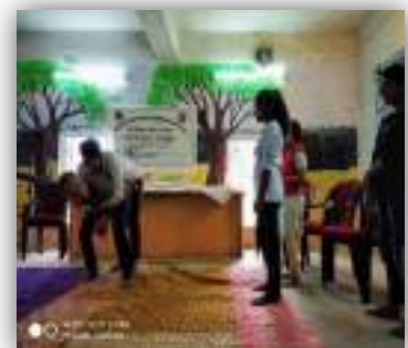
The Resource Person demonstrating techniques of Self-defence: Figure-6