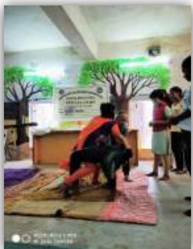
The Resource Person demonstrating techniques of Self-defence: Figure-14