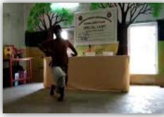
Dance performance by Samrat Dutta: Figure-1