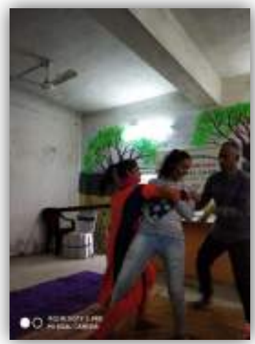
The Resource Person demonstrating techniques of Self-defence: Figure-15