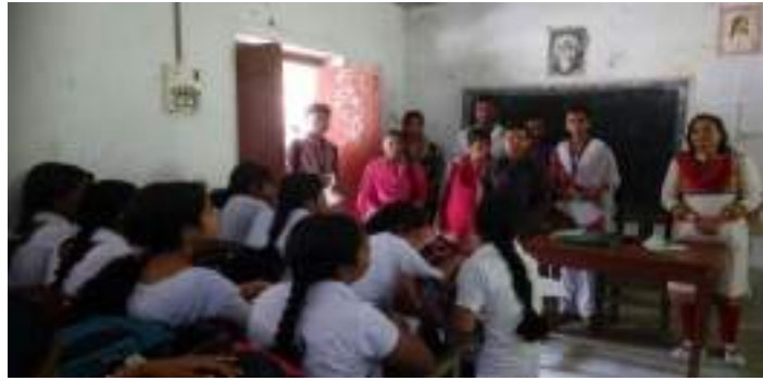
QUAMI EKTA WEEK