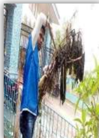
Volunteers working at the herbal garden: Figure-3