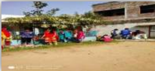
Shramdan by Volunteers: Figure-1