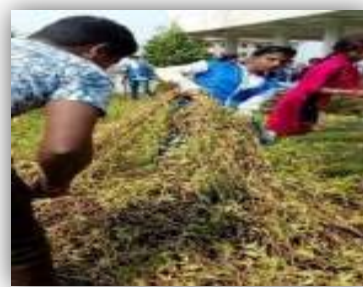
The volunteers working at the front garden: Figure-15