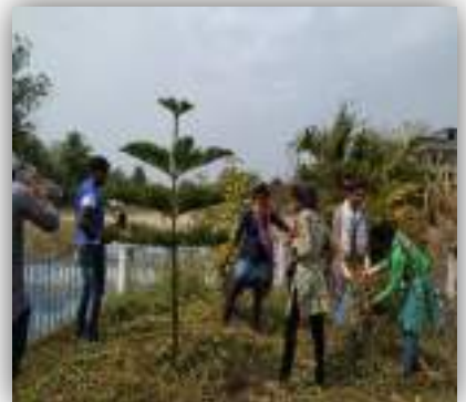
The volunteers working at the front garden