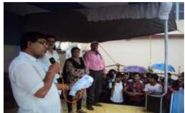
SAFE DRIVE SAVE LIFE