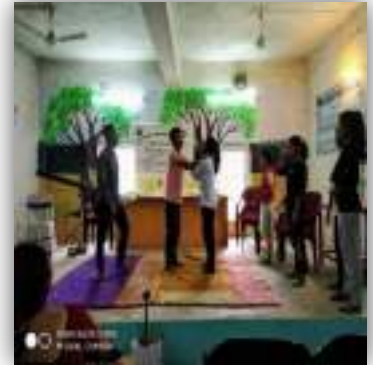
The Resource Person demonstrating techniques of Self-defence: Figure-9