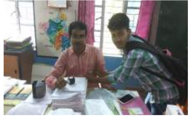
Quami Ekta Week Observation