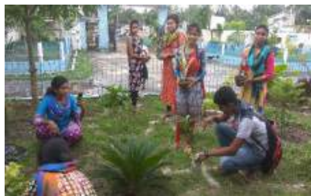
Shantiniketan Utsav and Tree Plantation at B.H.K.M