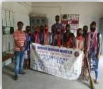
Group- 1 with the Day in-charge

Shramdan: The Volunteers were taken to the worksite of the day from the seminar hall. The work site comprised of the rooms of the college, the outside front of the college building and the area of the water harvesting. All volunteers again were divided into three groups. It took great effort from a few among the volunteers to clear the water harvesting area which was blocked with weeds. However the task of the day was completed successfully and the volunteers cleaned themselves for lunch session.