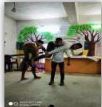
The Resource Person demonstrating techniques of Self-defence: Figure-3