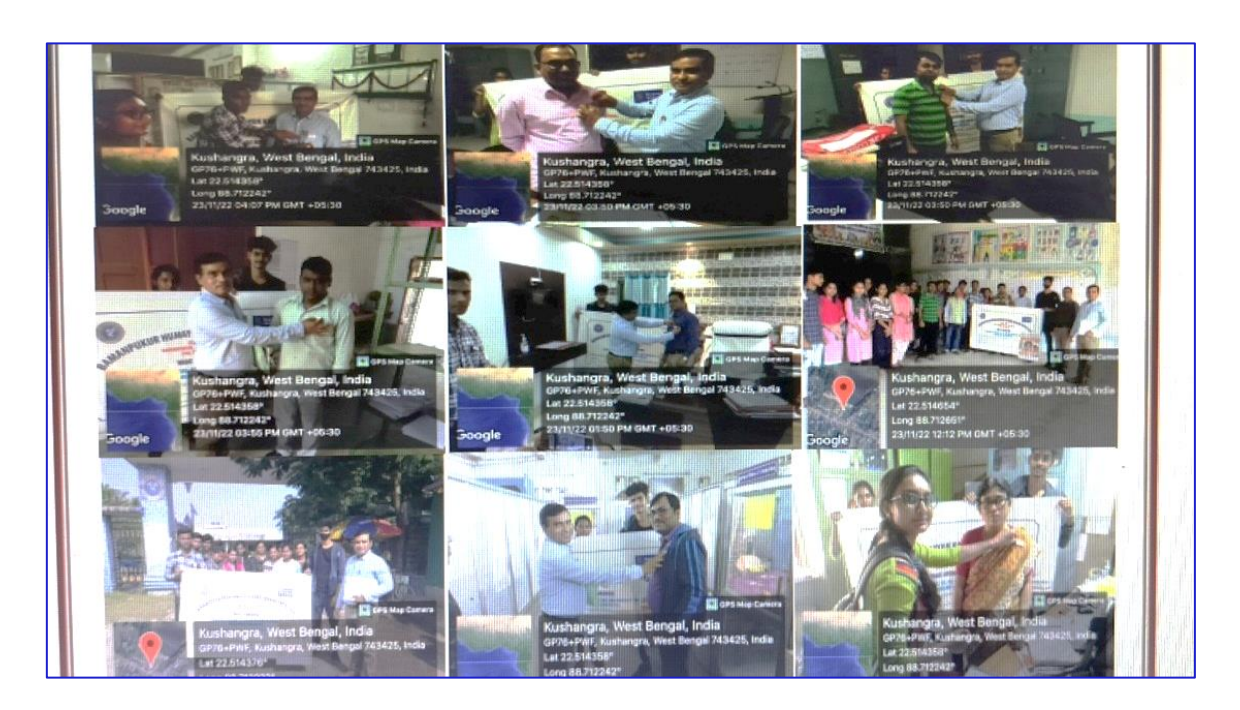
Glimpses of events of Student Development Cell