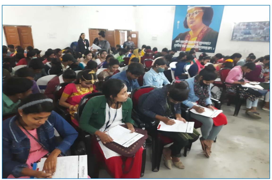
Students were attending the training nicely