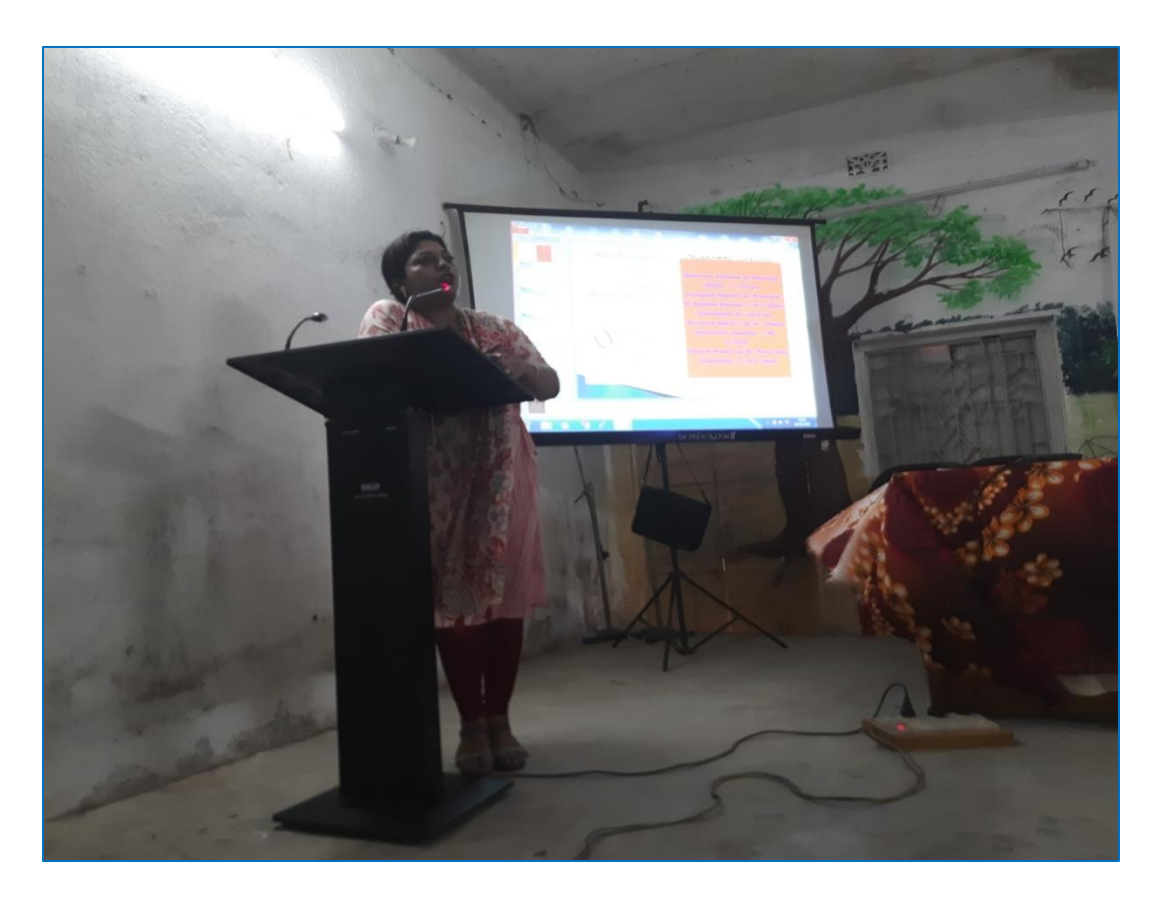
The librarian gave an idea on LMS, Library automation and KOHA