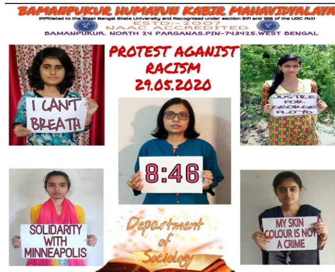
The Poster Prepared by students of Department of Sociology, BHKM