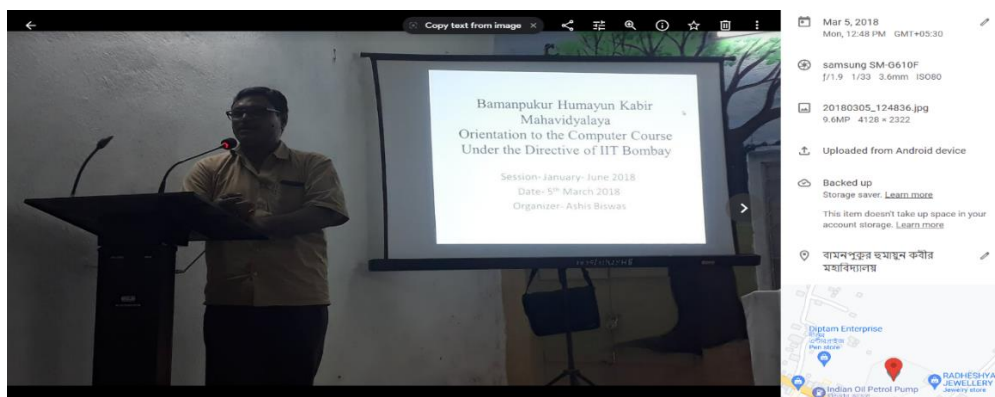
Principal's Speech: Figure-2