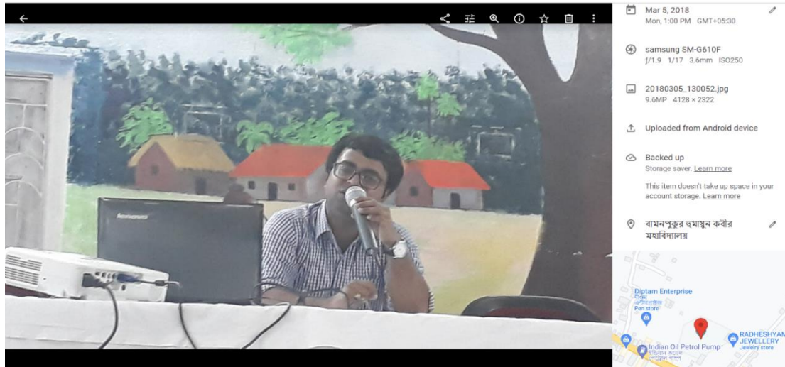
Organising secretary delivering his speech