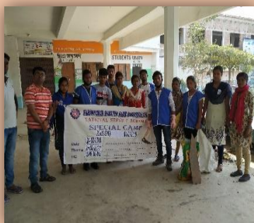
Group-2 with the Day in-charge