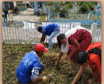
The volunteers working at the front garden: Figure-5