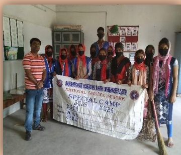
Group- 1 with the Day in-charge

Shramdan: The Volunteers were taken to the worksite of the day from the seminar hall. The work site comprised of the rooms of the college, the outside front of the college building and the area of the water harvesting. All volunteers again were divided into three groups. It took great effort from a few among the volunteers to clear the water harvesting area which was blocked with weeds. However the task of the day was completed successfully and the volunteers cleaned themselves for lunch session.