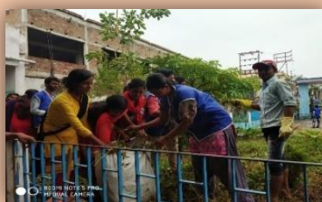
Volunteers working at the Front Garden: Figure-3