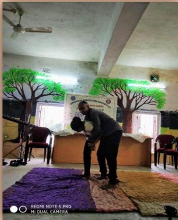
The Resource Person demonstrating techniques of Self-defence: Figure-10