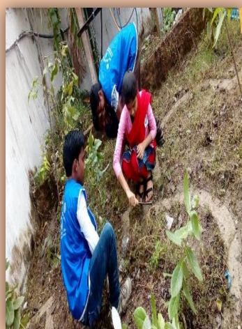
Volunteers working at the herbal garden: Figure-2