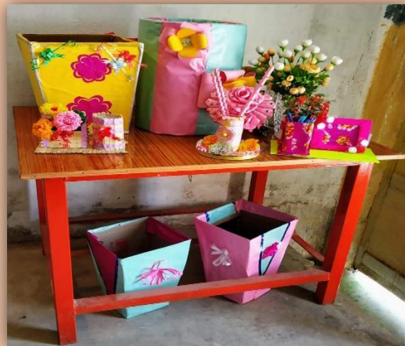
The handcraft made by the volunteers