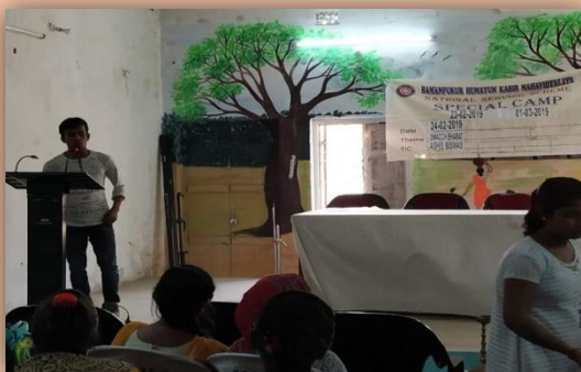
Volunteers interacting with one another: Figure- 1