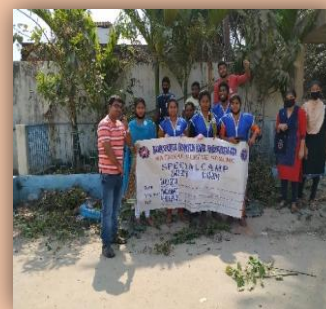
Group- 3 with the Day in-charge