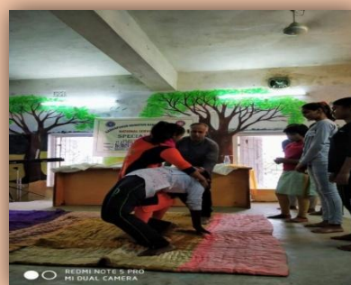
The Resource Person demonstrating techniques of Self-defence: Figure-5