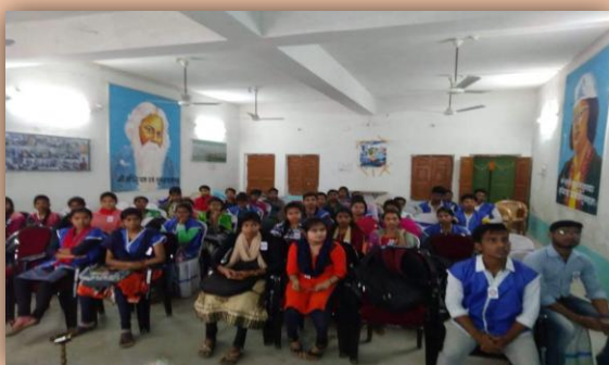
Volunteers attending the seminar session