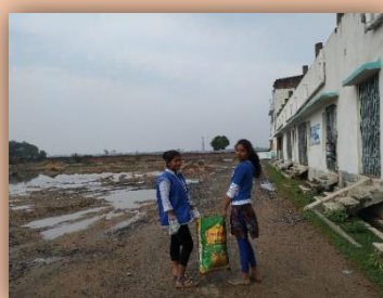
Volunteers taking the wastes to the waste management area