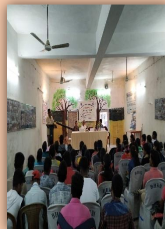
Volunteers attending the seminar