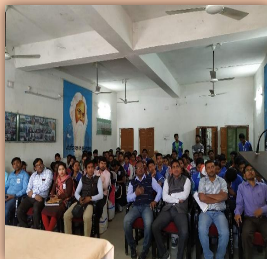
The audience listening to the session

Remembering the Martyrs of Pulwama attack: After the felicitation ceremony one minutes of silence is observed in the memory of the martyrs of Pulwama attack on 14 th February, 2019 at the Jammu Srinagar National Highway.