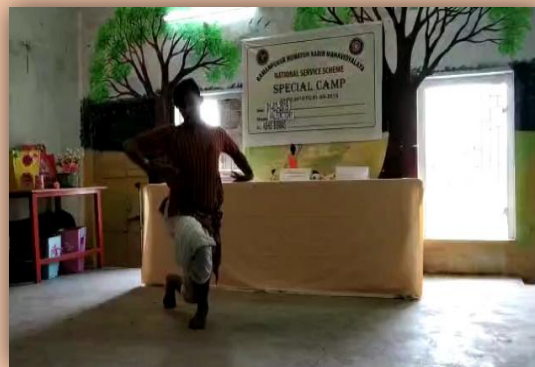
Dance performance by Samrat Dutta: Figure-1