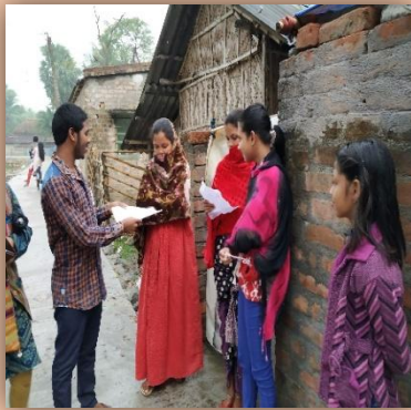
Volunteers distributing leaflet and interacting with the locals: Figure-1