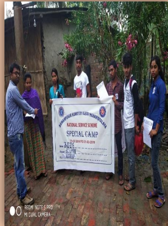
The Programme Officer distributing the leaflet on Dehydration