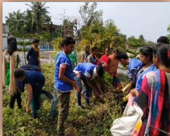
The volunteers working at the front garden: Figure-1