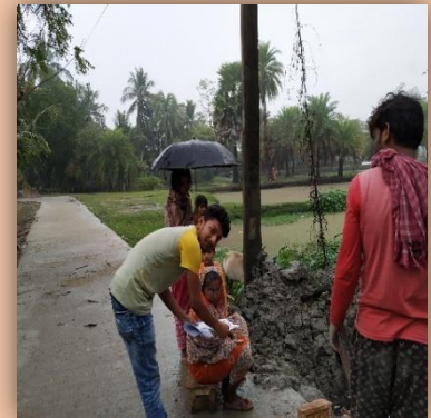
Volunteers distributing leaflet and interacting with the locals: Figure-3