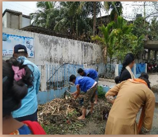
Volunteers gathering garbage from the front of the water management area