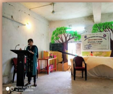
Volunteers talking about the camp: Figure-2