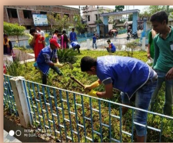
The volunteers working at the front garden: Figure-14