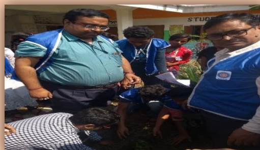
Honourable Principal wearing the NSS Uniform during tree plantation programme