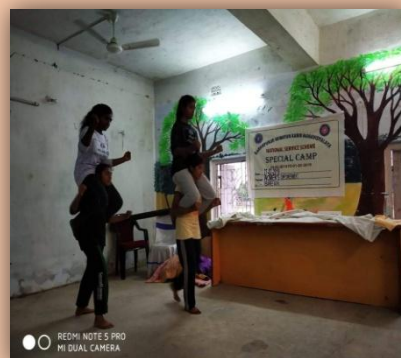
The Resource Person demonstrating techniques of Self-defence: Figure-2