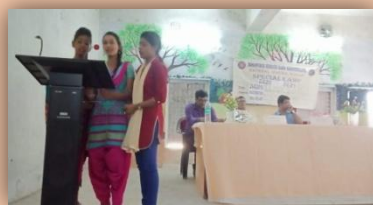
Inaugural Song by the Volunteers