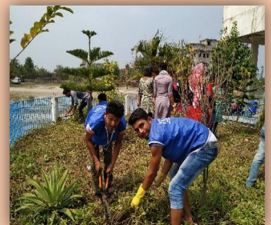
The volunteers working at the front garden: Figure-9