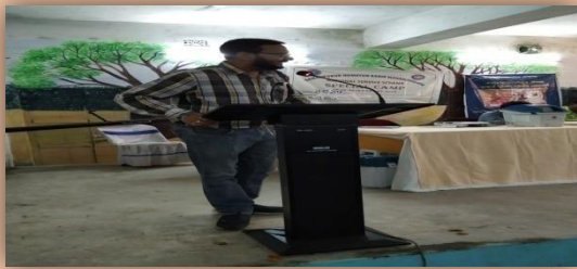
B.D.O. Official introducing the EVM and VVPAT to the volunteers