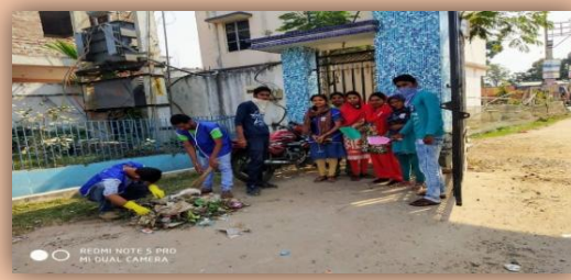
Shramdan by Volunteers: Figure-2

The Interactive Session: The interactive session began at about 02.00 pm at the seminar hall. Since it was the first day, all volunteers introduced themselves to one another and share their experience of the day's works. This continues for one hour. This is followed by an half an hour of tea break. After that the cultural session began.