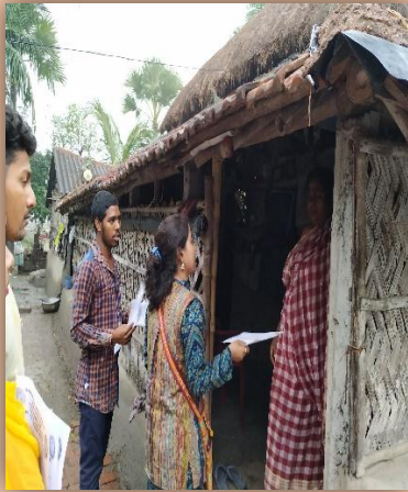
The Day In-charge interacting with a local on the awareness related to Dehydration