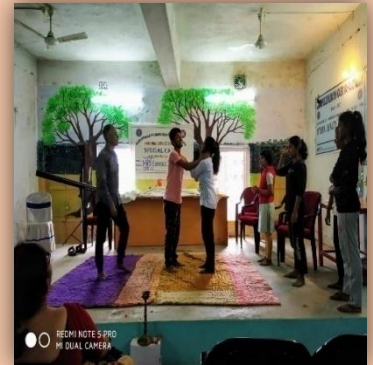
The Resource Person demonstrating techniques of Self-defence: Figure-9