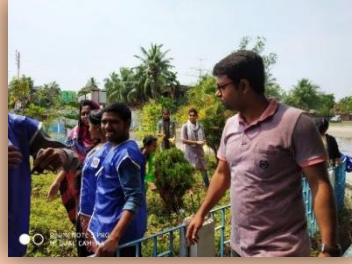
The Programme Officer monitoring the day's work: Figure-1