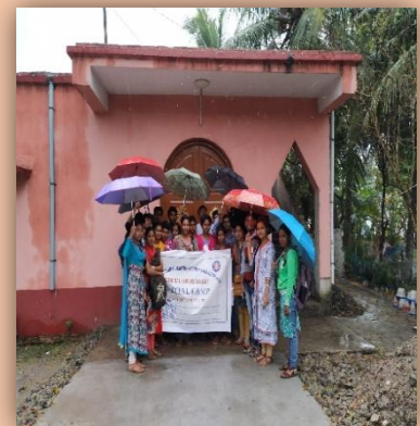
A photo session in front of the Church of Christian Para