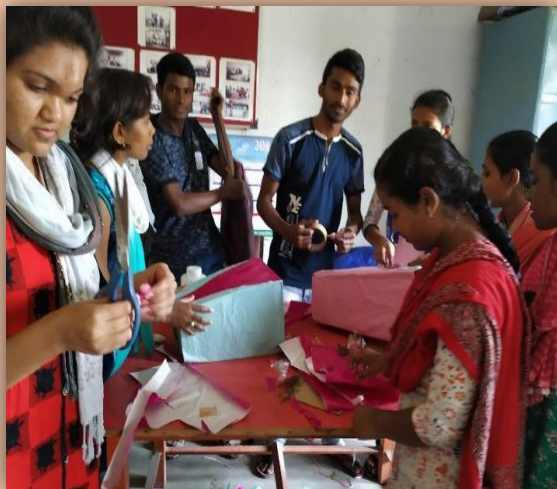
Volunteers giving the final touches to the handcrafts

Exhibition of Handcrafts: The Volunteers' own hand-made crafts that they completed during the camp were put for exhibition at the dais.