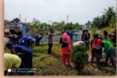
The Programme Officer monitoring the day's work: Figure-2