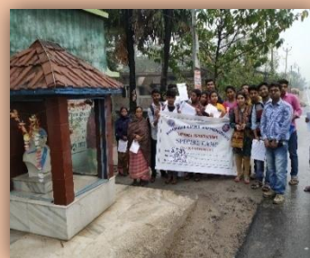
Volunteers with the locals of the Cristian Para