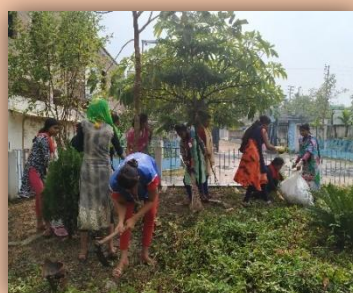
Volunteers working at the Front Garden