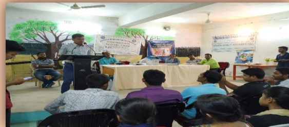
The hon'ble B.D.O of Minakhan introducing the EVM and VVPAT to the volunteers