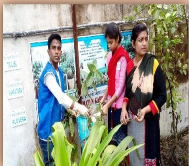
Volunteers working at the herbal garden: Figure-4