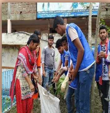
Volunteers cleaning the garden right side of the college gate