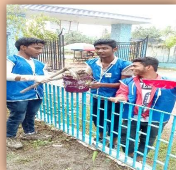
Volunteers working at the herbal garden: Figure-6