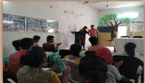
Day in-charge interacting with the Volunteers: Figure- 2