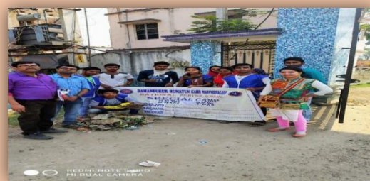
Volunteers with the Day In-charge and Programme Officer and other Faculty members: Figure-2