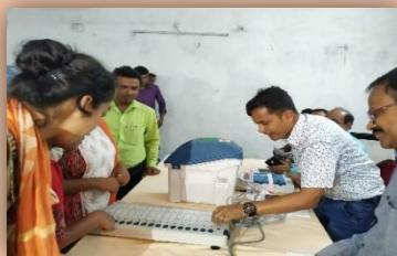
The hon'ble B.D.O. of Minakhan teaching the function of EVM and VVPAT to the volunteers