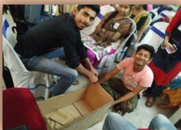
Volunteers making handcrafts: Figure-1

Handcraft Making Session: The volunteers then involved themselves in making various tools from daily used materials after a few minutes of break. They made pen keeper, waste bins, showpieces etc. to make an exhibition on the final day. Everyone was bit tired with the day's work but every moment gave them joy and a feeling of togetherness. The session came to an end at about 4.30 pm. The vote of thanks from the day in-charge followed accompanied by NSS clap.