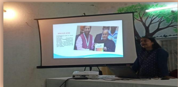
The Day in-charge conducting the seminar: Figure-2