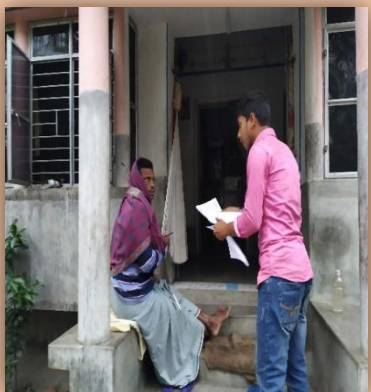
Volunteers distributing leaflet and interacting with the locals: Figure-4