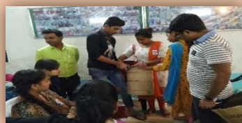
The Day In-charge and the Programme Officer supervising the session