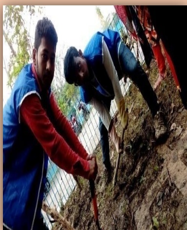
Volunteers working at the herbal garden: Figure-1

Shramdan: It was the last day of the 7 Day NSS Special Camp, i.e. the Valedictory Day. The Day in-charge was the Programme Officer, Ashis Biswas. The day began with the volunteers gathering in the seminar room (at about 11.00 am) from where they were led to the worksite of the day, i.e. the herbal garden. Here the volunteers worked from 11 am to 1 pm and completed the work allotted to them. Then they went for the lunch and after the lunch they gathered at the front garden area for tree plantation programme.