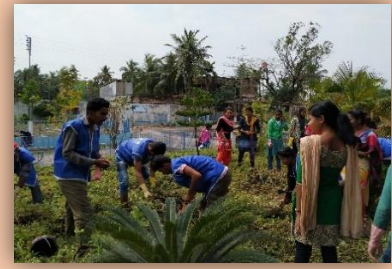
The volunteers working at the front garden: Figure-3