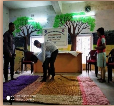
The Resource Person demonstrating techniques of Self-defence: Figure-8