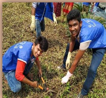
The volunteers working at the front garden: Figure-8