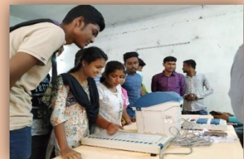
The volunteers learning the function of EVM and VVPAT

Handcraft Making Session: The volunteers then involved themselves in making various tools from daily used materials after a few minutes of break. They made pen keeper, waste bins, showpieces etc. to make an exhibition on the final day. Everyone was bit tired with the day's work but every moment gave them joy and a feeling of togetherness. The session came to an end at about 4.30 pm. The vote of thanks from the day in-charge followed accompanied by NSS clap.