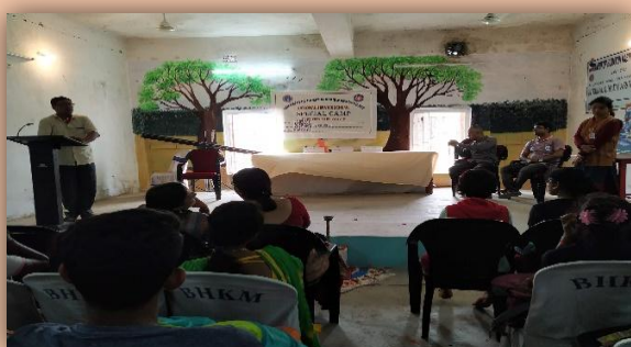
Hon'ble Principal giving a speech on women empowerment