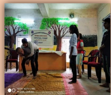
The Resource Person demonstrating techniques of Self-defence: Figure-6