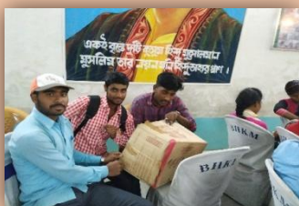
Volunteers making handcrafts: Figure-4