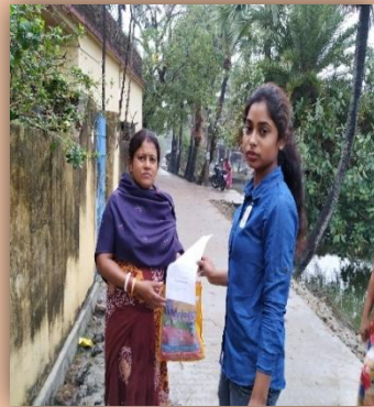
Volunteers distributing leaflet and interacting with the locals: Figure-2