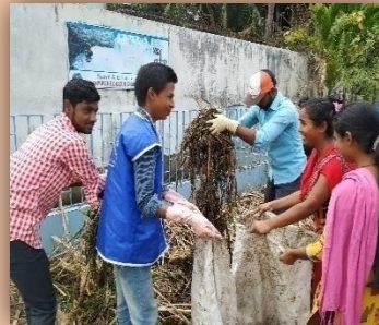
Volunteers putting the garbage in the bag