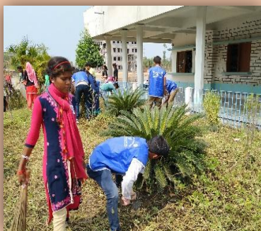
The volunteers working at the front garden: Figure-7