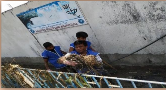
Volunteers working hard at the water harvesting: Figure-1