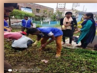
Volunteers working at the Front Garden: Figure-2