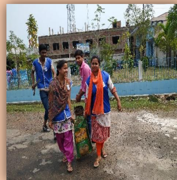
Volunteers transferring garbage to the waste management area