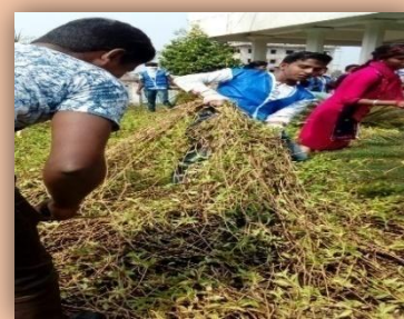
The volunteers working at the front garden: Figure-15