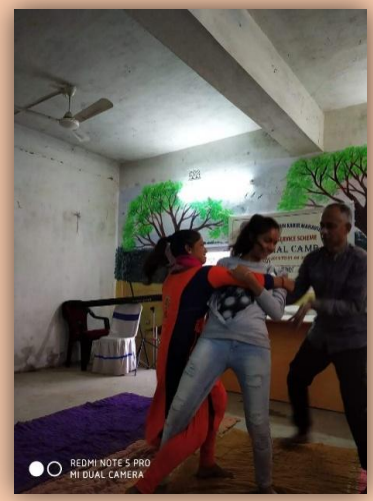
The Resource Person demonstrating techniques of Self-defence: Figure-15