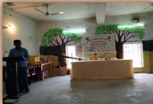
Song by S.N.Verma