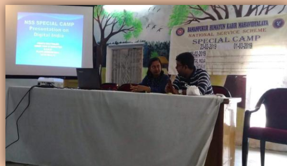
The Day in-charge and Programme Officer interacting with each-other