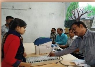
B.D.O. Officials teaching the function of EVM and VVPAT to the volunteers