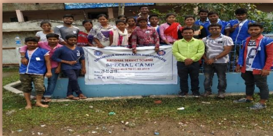
Volunteers in charge of the garden with the Day In-charge and the Programme Officer