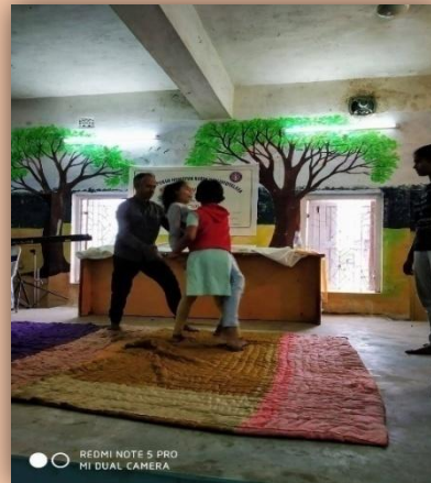
The Resource Person demonstrating techniques of Self-defence: Figure-11