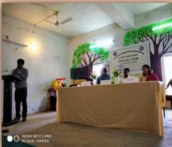
The Programme Officer addressing the audience