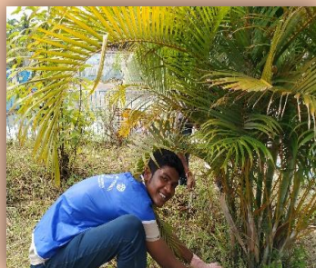
The volunteers working at the front garden: Figure-11