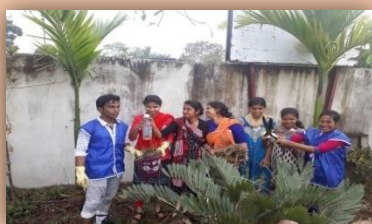
Volunteers taking some refreshments in between work