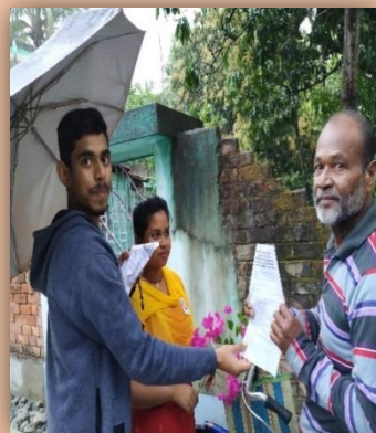
Volunteers distributing leaflet and interacting with the locals: Figure-5