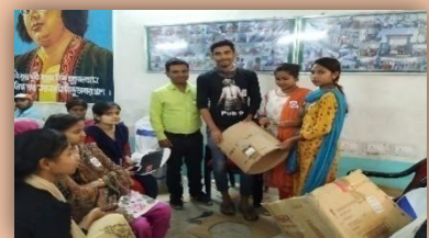
The Day In-charge supervising the session