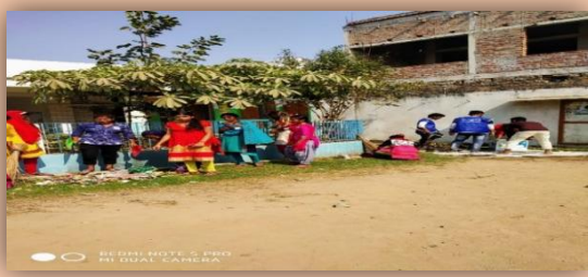
Shramdan by Volunteers: Figure-1