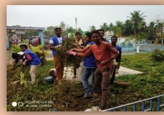
Volunteers working at the Front Garden: Figure-4