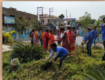
The volunteers working at the front garden: Figure-2