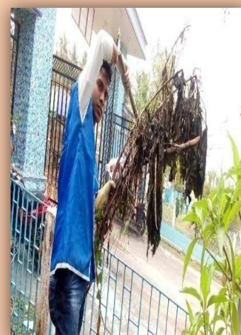
Volunteers working at the herbal garden: Figure-3