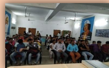
Volunteers attending the session on EVM and VVPAT