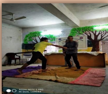
The Resource Person demonstrating techniques of Self-defence: Figure-4