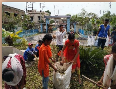
The volunteers working at the front garden: Figure-10