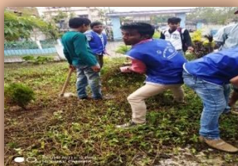
Volunteers working at the Front Garden: Figure-1