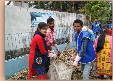
Volunteers taking the garbage from the water harvesting area to the waste management area