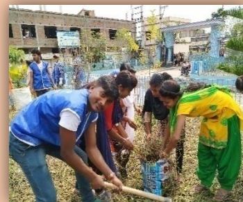
The volunteers working at the front garden: Figure-12