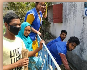
Shramdan of the Third Group at the water harvesting area