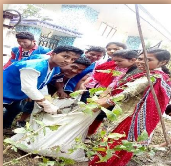
Volunteers working at the herbal garden: Figure-5