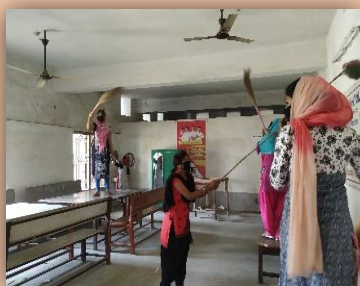
Shramdan of the First Group at the College building