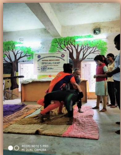
The Resource Person demonstrating techniques of Self-defence: Figure-14