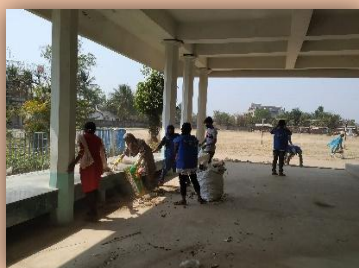
Shramdan of the Second Group in the front area of the college building