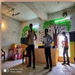
Volunteers talking about the camp: Figure-1

Volunteers Speech on the themes of NSS Special Camp: A few among the volunteers were selected to throw their observation on their experience of the camp and air view on the themes of each day of the camp. Volunteers showed confidence while putting their observation and all agreed that the camp was great experience for them; they learnt many things: the effectiveness of group work and helping one another, sharing with each other are a few of them.