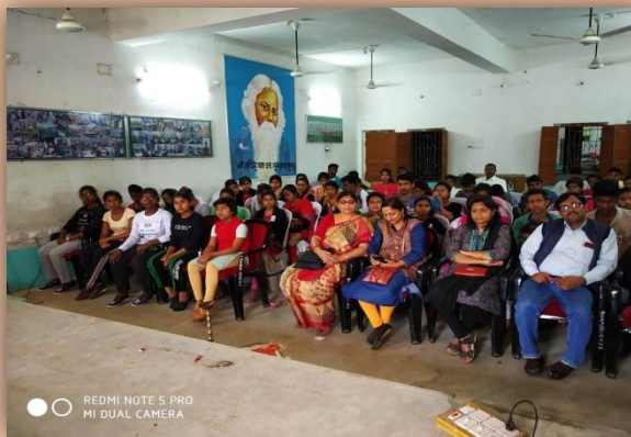
The NSS volunteers, the guests and the college faculty members attending the seminar