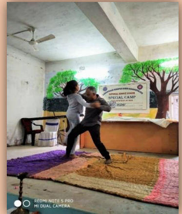
The Resource Person demonstrating techniques of Self-defence: Figure-12