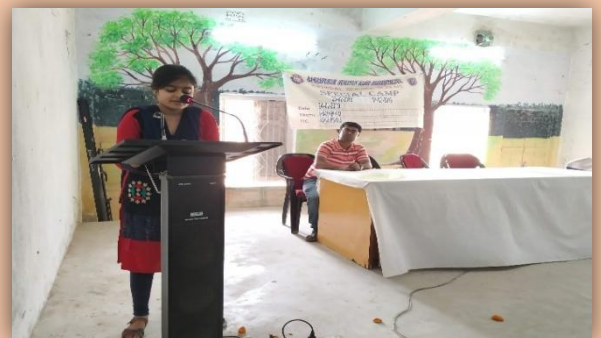
Volunteers interacting with one another: Figure- 2