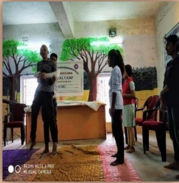
The Resource Person demonstrating techniques of Self-defence: Figure-7