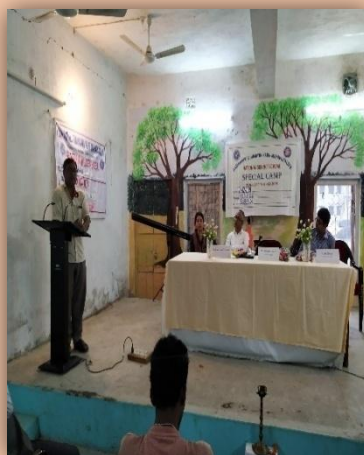
Principal addressing the volunteers