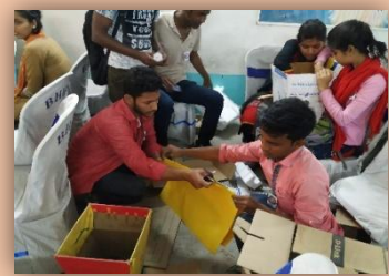
Volunteers making handcrafts: Figure-3