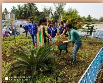
The volunteers working at the front garden: Figure-13