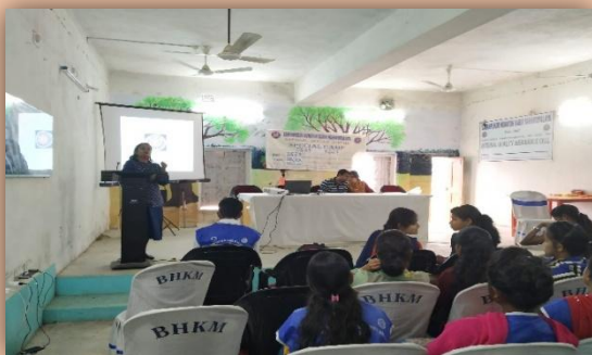
Day in-charge, Sumita Chatterjee introducing the day's theme

Seminar: The seminar of the day focused on the day's theme 'Digital India'. The in-charge of the day Sumita Chatterjee gave introduction to the 'Nine Pillars of Digital India', i.e. (1) Broadband Highway, (2) Universal Access to Phones, (3) Public Internet Access Programme, (4) E-Govenance-Reforming government through Technology, (5) eKranti- Electronic delivery of services, (6) Information for All, (7) Electronics Manufacturing Target NET ZERO Imports, (8) IT for Jobs, (9) Early Harvest Programmes. She then concluded with the vision of Digital India. The volunteers interacted with the in-charge and among themselves and exchanged their opinions. At about 4.30 pm the day's proceeding concluded with the summary of the day's work by the Programme Officer, Ashis Biswas which was followed by the vote of thanks to all volunteers and teachers present, along with the NSS clap by the volunteers.