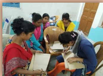
Volunteers making handcrafts: Figure-2