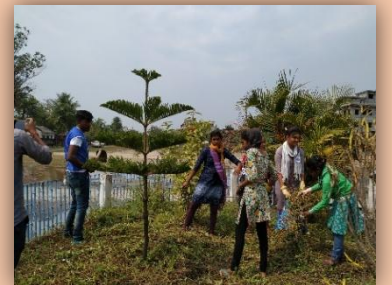
The volunteers working at the front garden: Figure-6