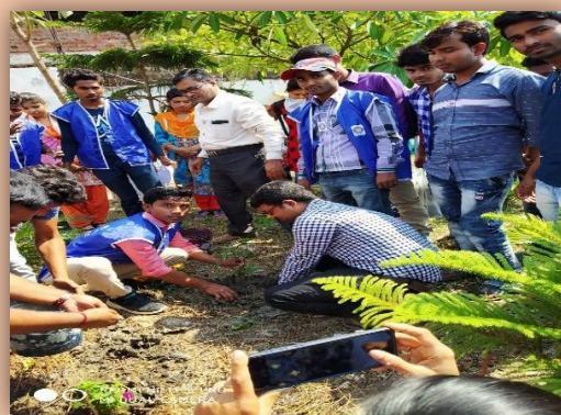
The Programme Officer participating in tree plantation programme on the valedictory