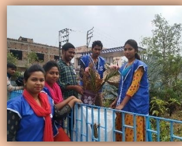
Volunteers gathering wastes in the waste bin