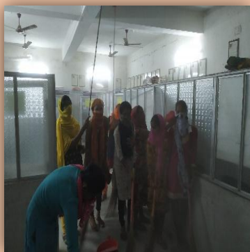
Volunteers cleaning the cubicle area

Shramdan: The volunteers cleared the garden area allotted for the day and completed their task by 1.30 pm. They cleaned themselves and went for their lunch. After lunch they all gather in the seminar hall to attend the workshop at about 02.00 pm.