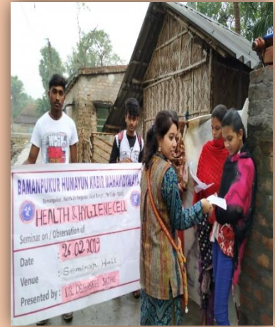
The Extension programme to Christian Para on the Awareness Dehydration in collaboration with The Health and Hygiene Cell