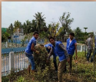
The volunteers working at the front garden: Figure-4