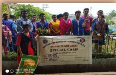
Volunteers with the Day In-charge and the Programme Officer

Shramdan: The worksite of the day's shramdan was the left half of the garden in front of college building. Three groups were formed and the worksite was distributed among these three groups under the respective group leaders. The volunteers worked hard to complete the cleaning of the garden. The work was completed in schedule time (1.30 pm). The volunteers then went to have their lunch and from there they gathered in the seminar room to participate in the seminar and workshop related to health and hygiene. Both the Seminar and Workshop sessions were collaborated with the Health and Hygiene Cell of the College.