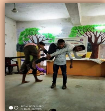
The Resource Person demonstrating techniques of Self-defence: Figure-3