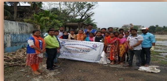
Volunteers in charge of taking the garbage from the water harvesting area to the waste management area

Workshop: The workshop began at 02.00 pm. The day in-charge made a brief introduction to the Process of General Election and the use of electronic voting machine. The honourable B.D.O. of the Minakhan Block especially came as the guest of honour and resource person to teach the volunteers the function and use of the EVM and VVPAT machine. He and one of the officials gave a formal introduction to the concept of the 17 th Lok Sabha Election, 2019 and the important role of the voters to make the election a successful event. The honourable B.D.O. then went on to theoretically explain the technicalities of the electronic voting machine and the function of the newly introduced Voter Verifiable Paper Audit Trail or VVPAT in the election. The process and functions of EVM and VVPAT were taught by hand by the B.D.O. and his Officials. The volunteers who were mostly composite of new voters took delight in leaning the process. And the workshop was a great success. After the completion of the workshop the day in-charge thanked the honourable B.D.O. and his officials for conducting the workshop with their own tools and technicians in the NSS special camp. The workshop concluded at 3.30 pm.