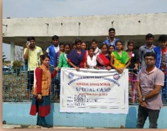
Volunteers with the Day In-charge and the Programme Officer