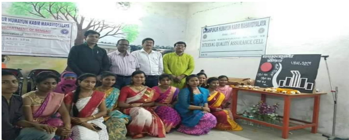
Annexure -3 Photo pf the Programme