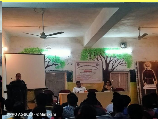
OPPO A5 2020