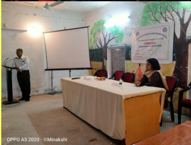
OPPO A5 2020