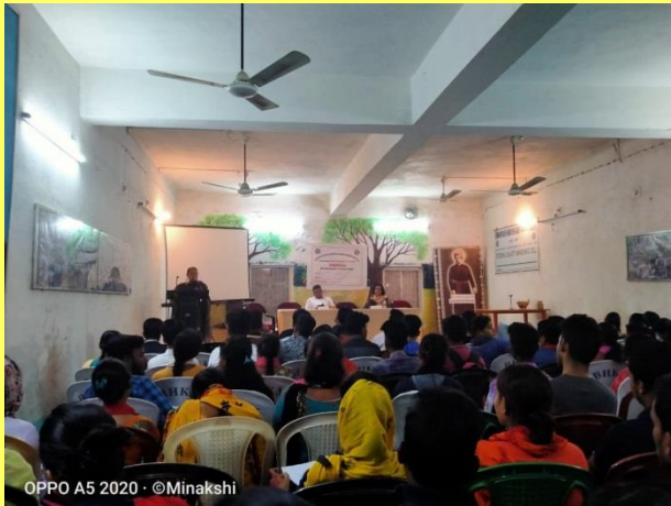
OPPO A5 2020