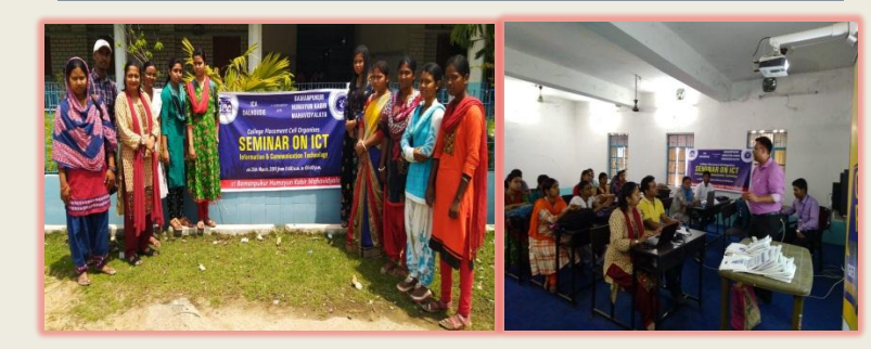
The students of the department participated in the seminar. on \mathcal{JCT}