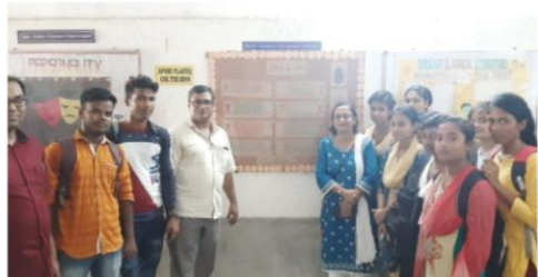
Department of Education -Theme of wall magazine- JainaPhilosophyEditorSumitachatt eriee