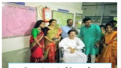
Department of Bengali - Theme of wall magazine- Bengali Poetry -Editor DebraHowlader