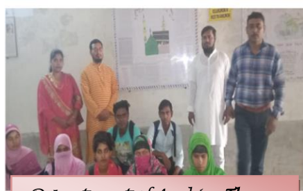
Department of Arabic -Theme of wall magazine life and History of Prophet-Editor MD Nasiruddin Mondal