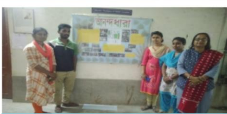
Department of Education Alumni-Theme of wall magazine- Environment and preservation of water Editor Sumitachatterjee